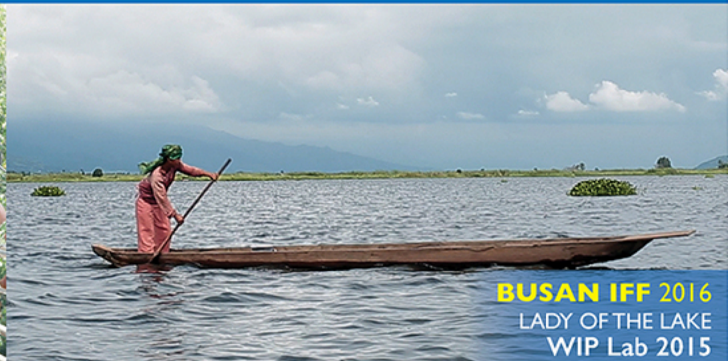
BUSAN IFF 2016 LADY OF THE LAKE WIP Lab 2015