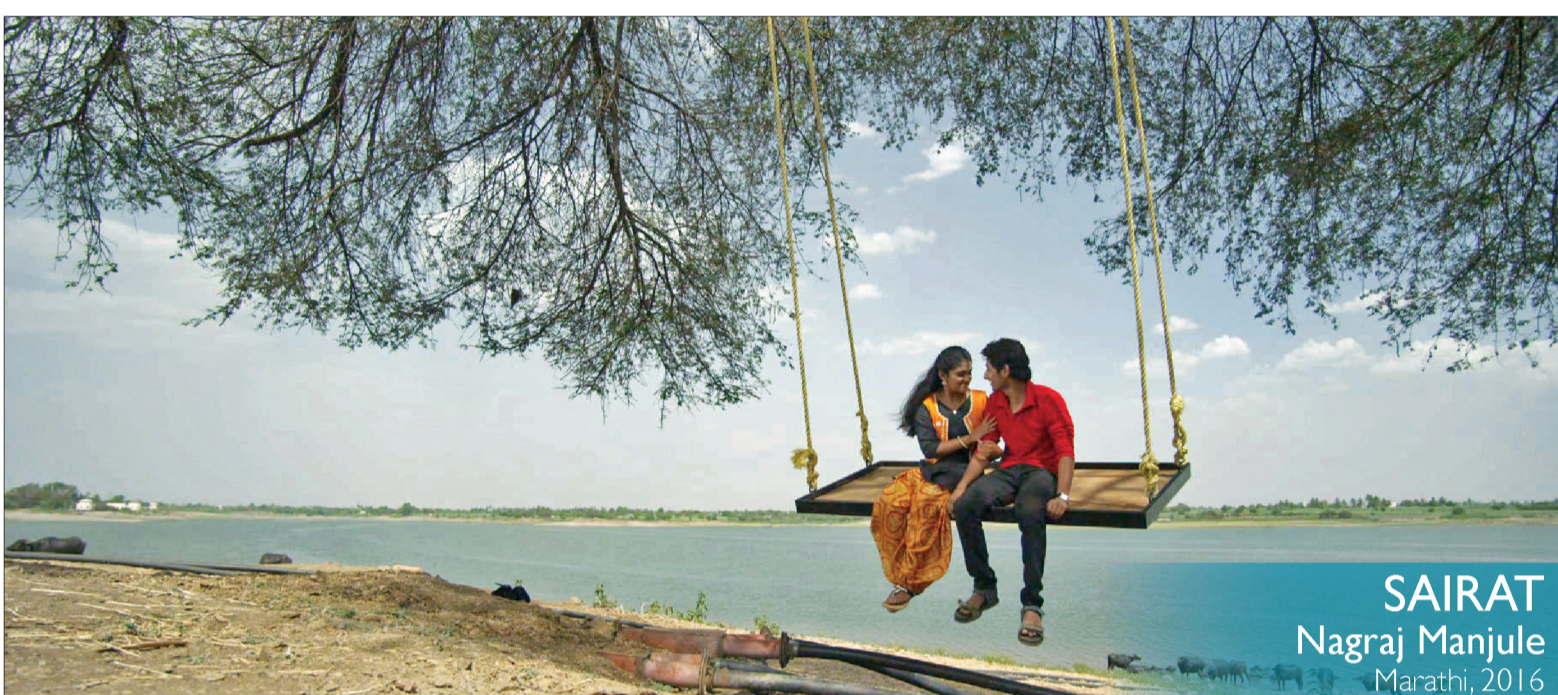
SAIRAT Nagraj Manjule Marathi, 2016

Screen your films at 3 digital theatres to a select audience of sales agents, distributors, producers and festival programmers