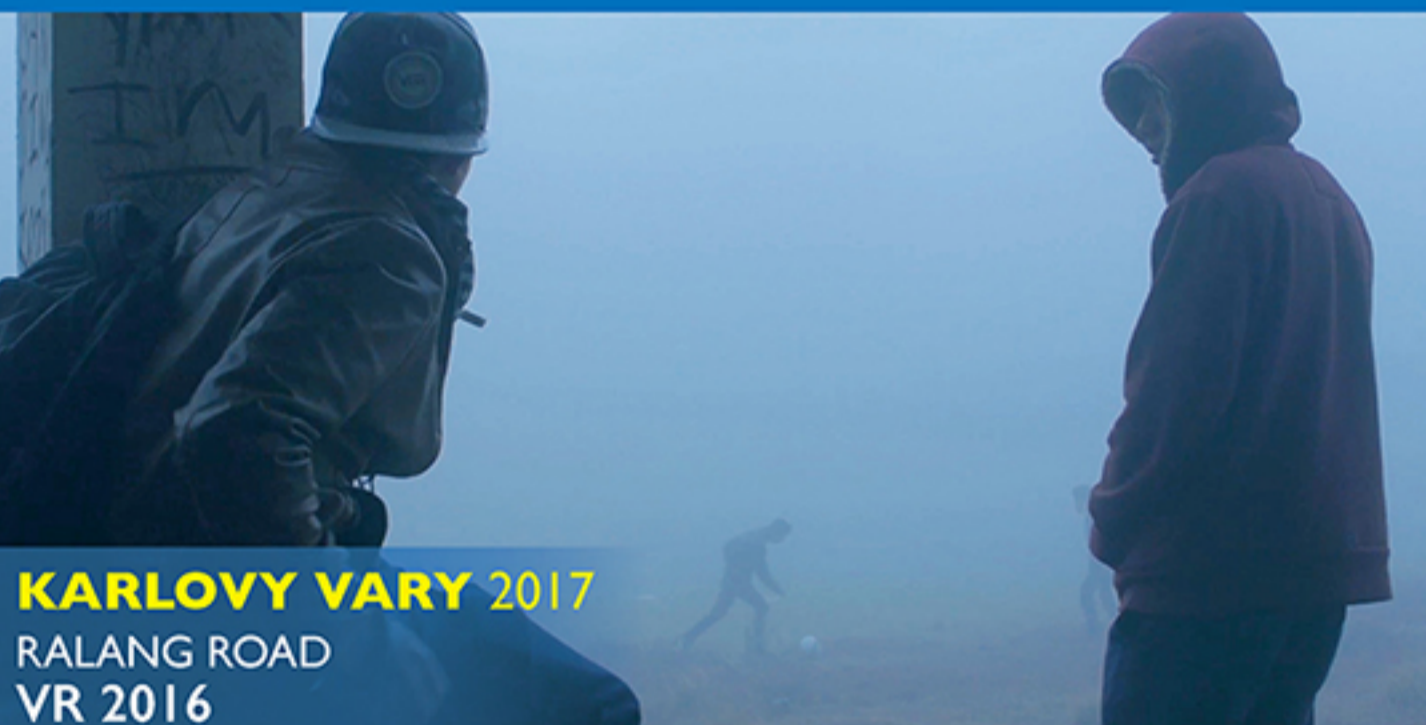
KARLOVY VARY 2017 RALANG ROAD VR 2016