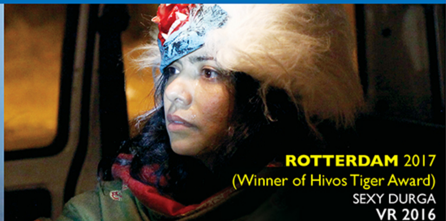
ROTTERDAM 2017 (Winner of Hivos Tiger Award) SEXY DURGA VR 2016