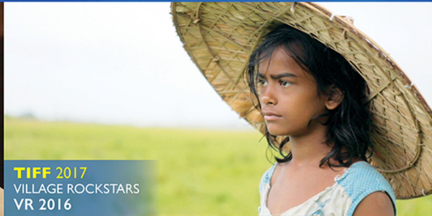
TIFF 2017 VILLAGE ROCKSTARS VR 2016

IS YOUR FILM LOOKING FOR FINISHING FUNDS • DISTRIBUTION • WORLD SALES • FILM FESTIVALS?