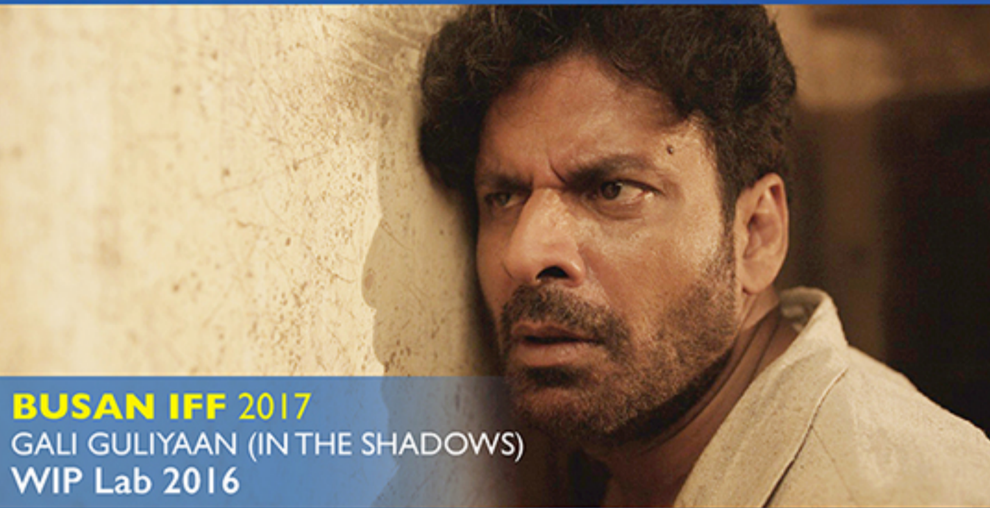
BUSAN IFF 2017 GALI GULIYAAN (IN THE SHADOWS) WIP Lab 2016