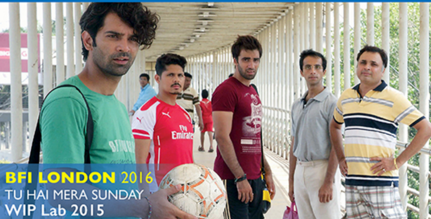
BFI LONDON 2016 TU HAI MERA SUNDAY WIP Lab 2015

IS YOUR FILM LOOKING FOR FINISHING FUNDS • DISTRIBUTION • WORLD SALES • FILM FESTIVALS?