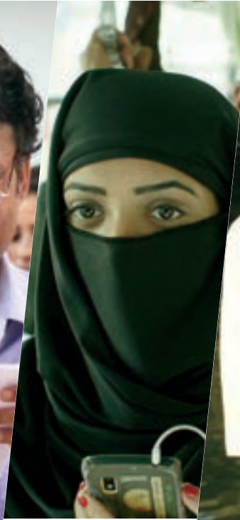
Lipstick Under My Burkha SWL 2012