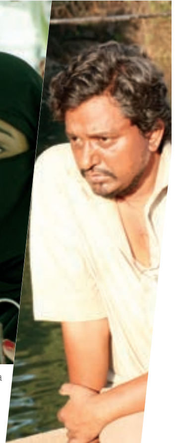
Paltadacho Munis SWL 2007