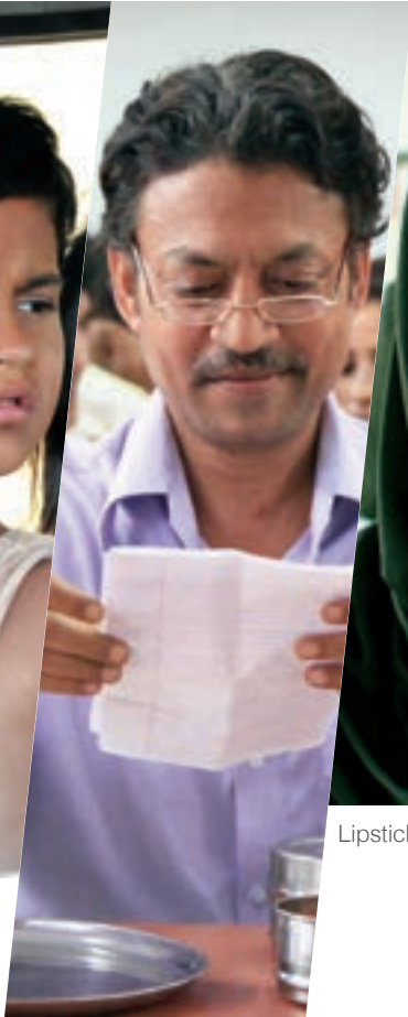
The Lunchbox SWL 2011