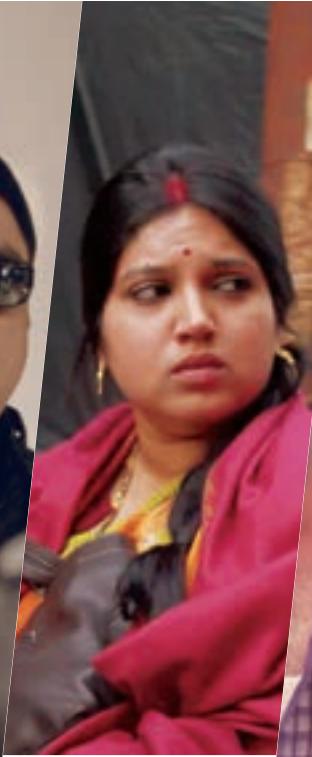
Dum Lagake Haisha SWL 2011