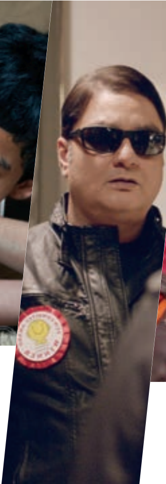
Island City SWL 2012