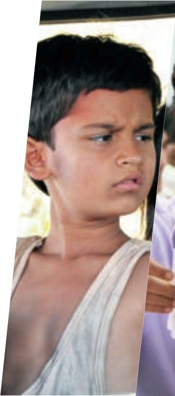
The Good Road SWL 2008