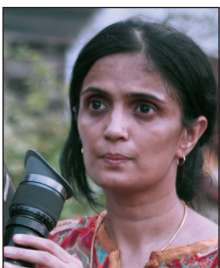
Janaki Vishwanathan Director

The film has been treated in a simple, stark fashion. It has a strong subtext and is yet straightforward enough to be understood by the common man. The goat is the motif and metaphor for the conflict. The film has no specific geography, yet its landscape is steeped in history. This offers the film a timeless quality, although, story is quite contemporary. The film has a truly global feel in terms of its context although it is strongly rooted in Indian culture, tradition and politics.